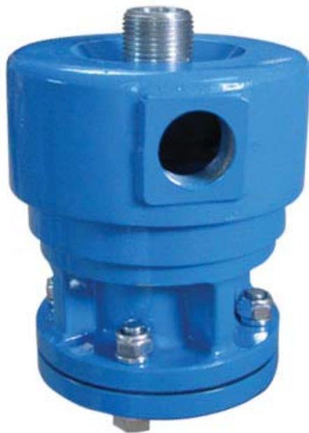
Helix 50 BSP Exhaust Control Valve

Featuring 19mm (3/4") ports, the PanBlast™ Helix 50 BSP Exhaust Control Valve may also be combined with the PanBlast™ Helix 100 BSP Inlet Control Valve, to create the Helix 150 BSP Remote Control Valve, which is a combined inlet and exhaust valve in the one compact assembly.