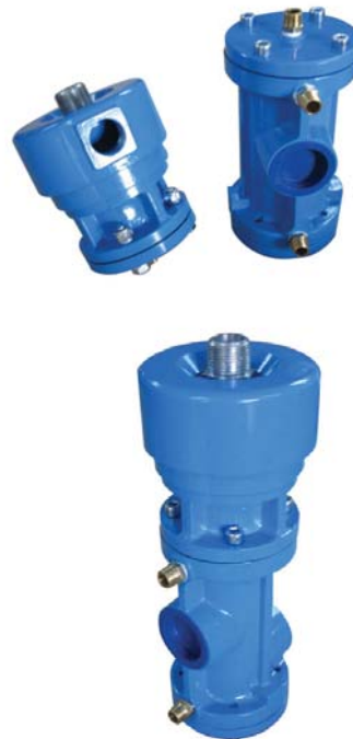
Helix 150 BSP Combination Inlet And Exhaust Valve