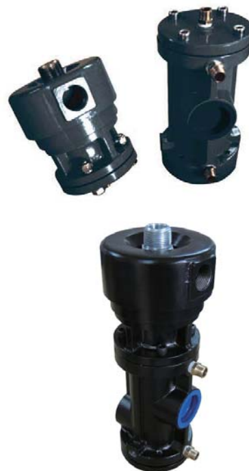
Helix 150 NPT Combination Inlet And Exhaust Valve