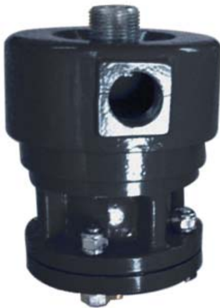
Helix 50 NPT Exhaust Control Valve

Featuring 19mm (3/4") ports, the PanBlast™ Helix 50 NPT Exhaust Control Valve may also be combined with the PanBlast™ Helix 100 NPT Inlet Control Valve, to create the Helix 150 NPT Remote Control Valve, which is a combined inlet and exhaust valve in the one compact assembly.