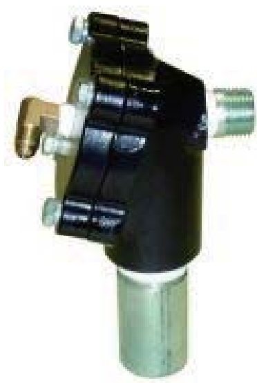
Sola 5 Exhaust Valve

A full range of service kits and parts are available and these parts are all fully compatible with the OEM products. The Sola 5 Valves are also available in BSP configuration.