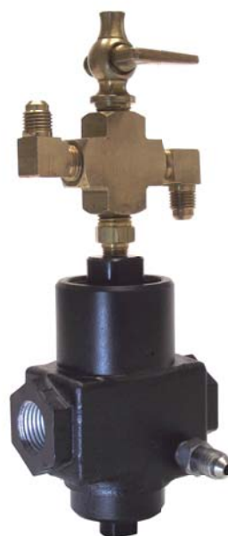
Sola 5 Inlet Valve