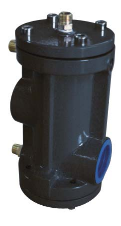
Helix 100 NPT Inlet Control Valve

Featuring 32\text{mm}(1\ 1/4") ports, the PanBlast<sup>TM</sup> Helix 100\ \text{NPT} Inlet Control Valve may also be combined with the PanBlast<sup>TM</sup> Helix 50\ \text{NPT} Exhaust Control Valve, to create the Helix 150\ \text{NPT} Remote Control Valve, which is a combined inlet and exhaust valve in the one compact assembly.