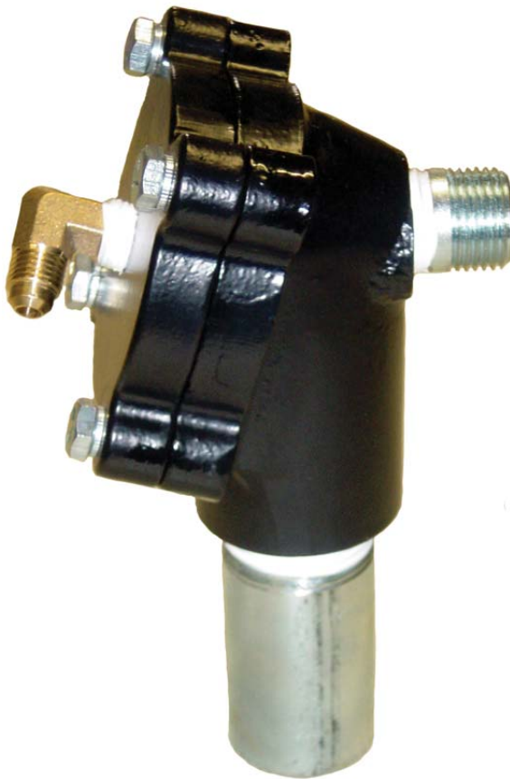
Sola 5 BSP Exhaust Valve

A full range of service kits and parts are available and these parts are all fully compatible with the OEM products. The PanBlast™ Sola 5 BSP Remote Control Valve is also available in both BSP and NPT configurations, making suitable for all global markets.