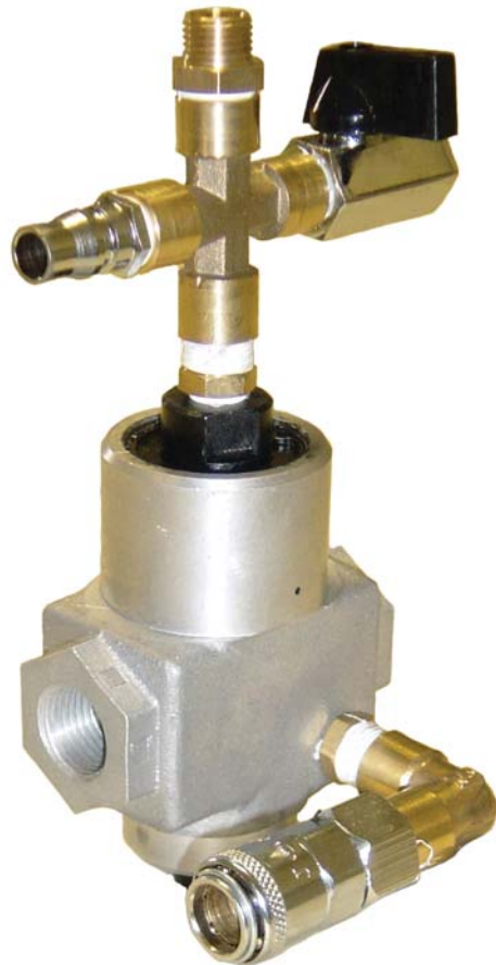
Sola 5 BSP Inlet Valve

Blast Pots & Cabinets - Remote Control Valves - Abrasive Control Valves - Blast Nozzles - Nozzle Holders & Couplings - Helmets & Breathing Air Filters